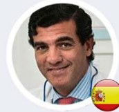
Pepe Zamorano, Spain Ambassador of ESC