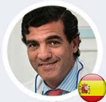
Zamorano, Spain Ambassador of ESC