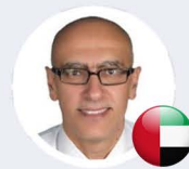
Mohammed Salah, UAE